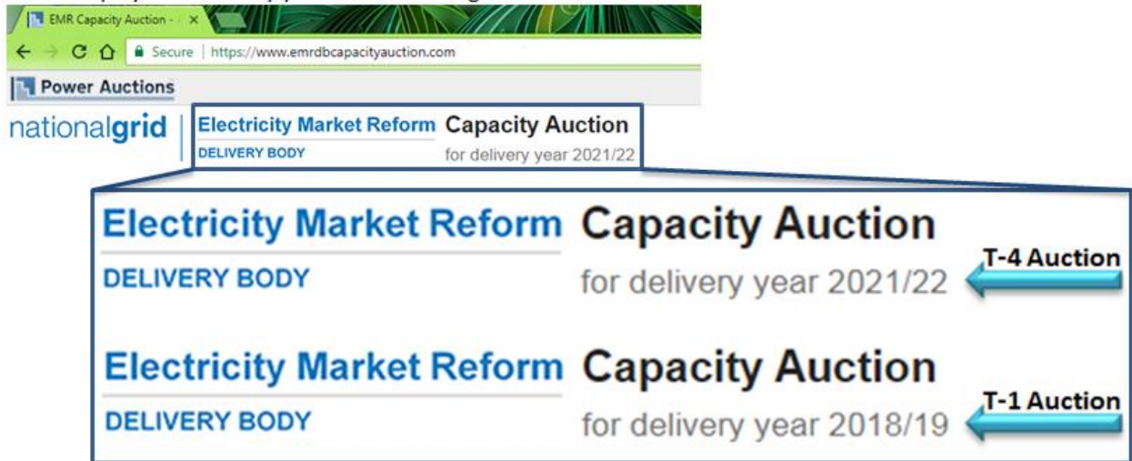
Figure 2: Checking the delivery year when on the Auction system

Users are strongly encouraged to check if they are in the correct Auction at any point by referring to the title bar which displays the delivery year as shown in figure 2.